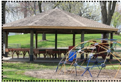
Carpet Ball Pavilion/Playground