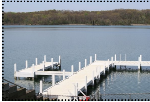
Water Front Swimming/Boating Area

Army Lake Camp consists of 200 acres of thick woodlands and manicured grounds that feature a magnificent spring-fed lake and an array of state-of-the-art facilities. Founded in 1922 by The Salvation Army the camp has grown through the years and now has the capability of housing 425. During the summer the camp is used by the salvation army as a residential summer camp for children, youth and families with guest rental groups using the facilities on summer weekends and during the off season. The camp has a variety of recreation activities to interest participants of all ages. The camp is only 50 miles from Libertyville (1 hour and 15 minute drive) located amidst beautiful Wisconsin farmland near the small town of East Troy.