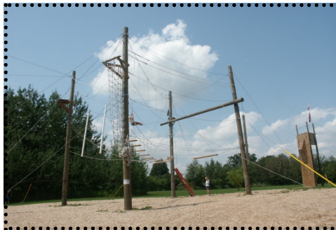
High Ropes Course/Climbing Wall